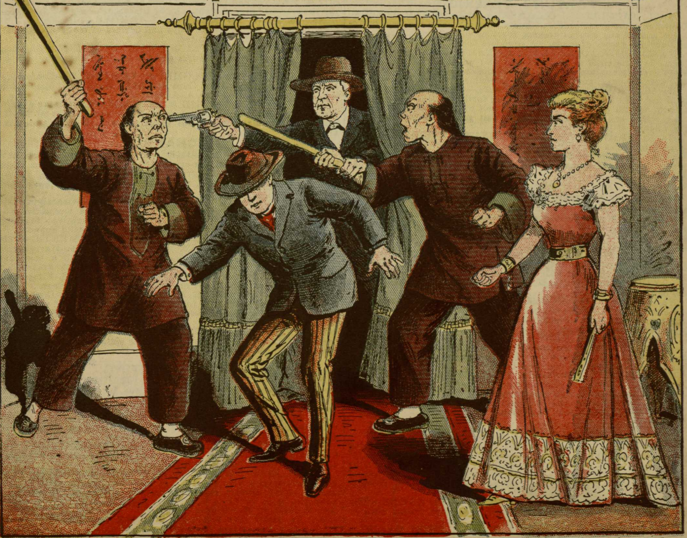
Young King Brady dropped to the floor, Old King Brady grabbed Yung Foo's wrist and pressed his revolver at the head of the other villainous Chinaman. The "Queen" was an interested onlooker.

THE BRADYS AMONG THE HOP FIENDS. BY A NEWYORK DETECTIVE.